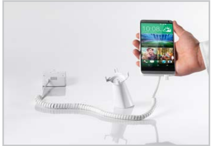
Power w/ Screamer Sensor