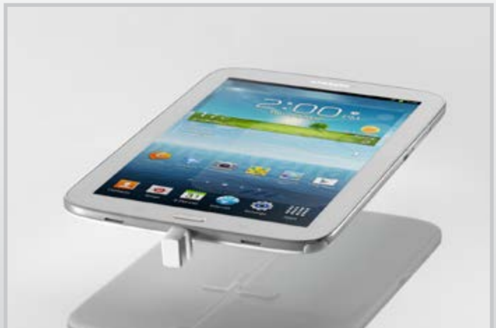
180° Micro USB Sensor